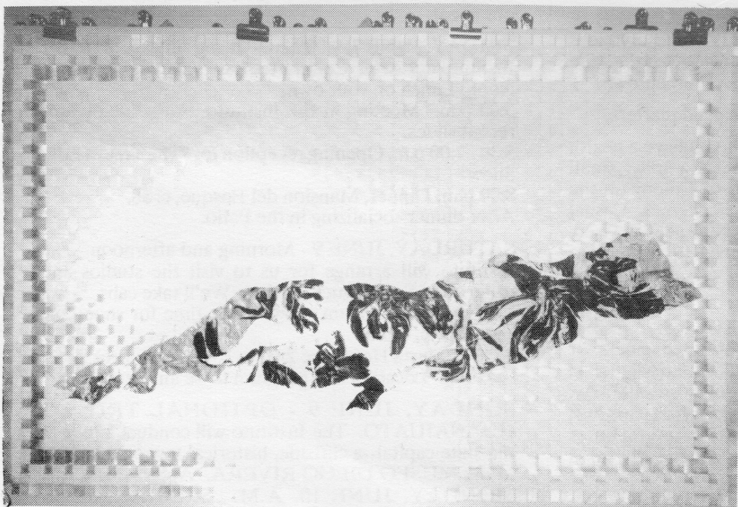
Reclining Figure, woven painting by T.F. Poduska